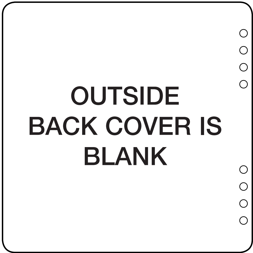
OUTSIDE BACK COVER