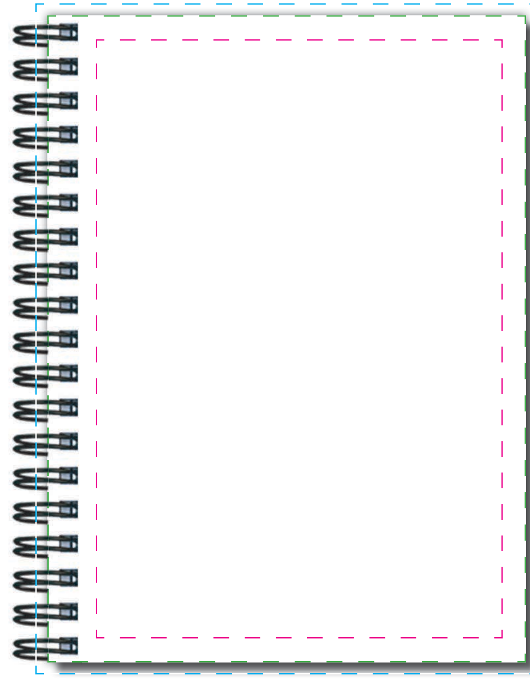
RMJ2-PS - Insert Sheets (if ordered)