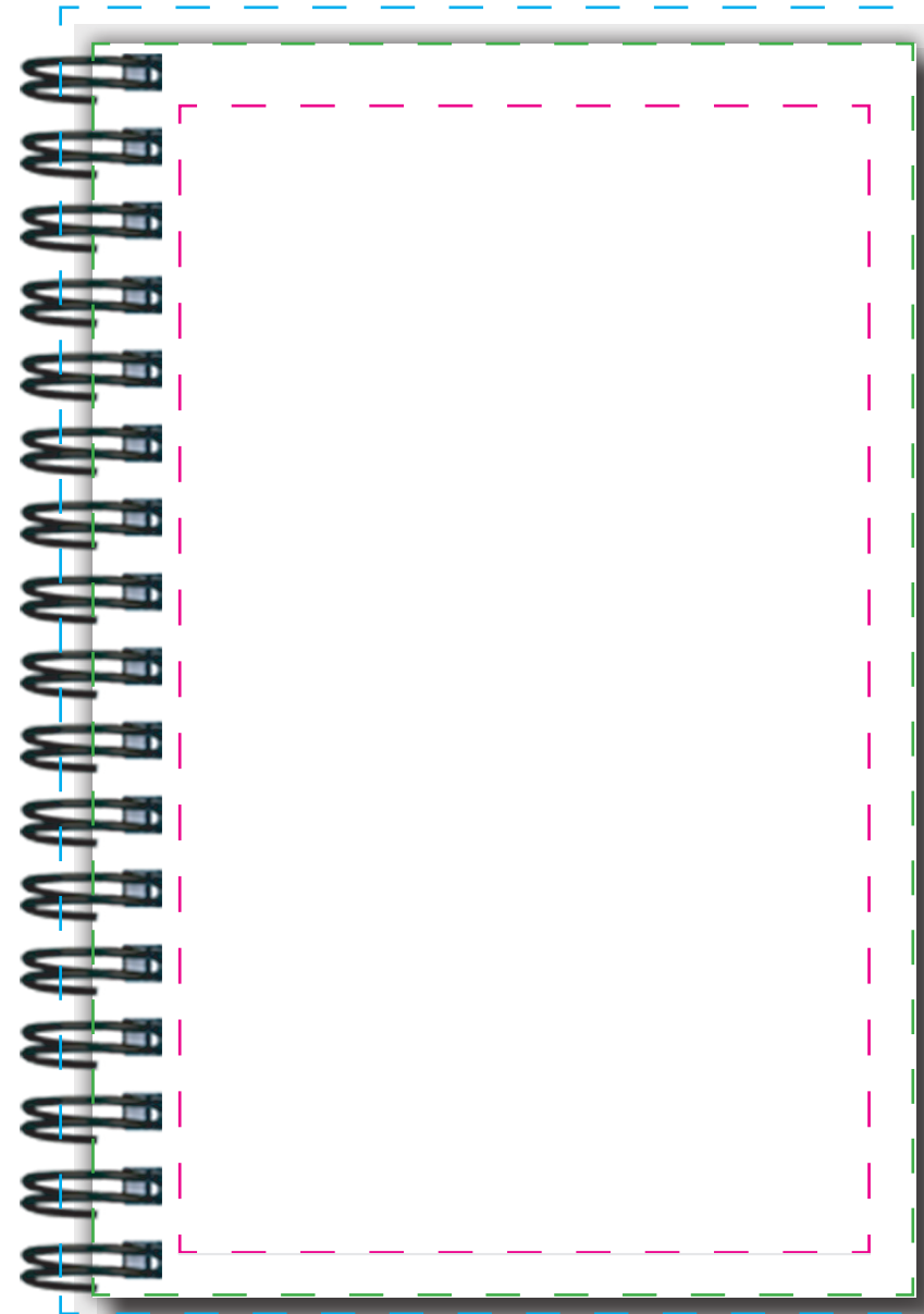
JJ2S-PS - Insert Sheets Size: 3.9375 X 6 Imprint: 3.3125 X 5.5 Imprint w/Bleed: 4.25 X 6.25