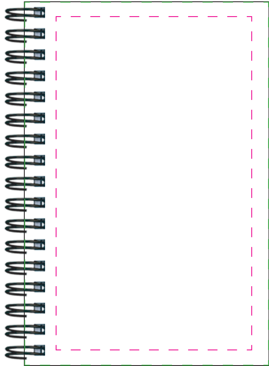
JJ2S-PS - Front Cover Contact Customer Service for die -cut sizes