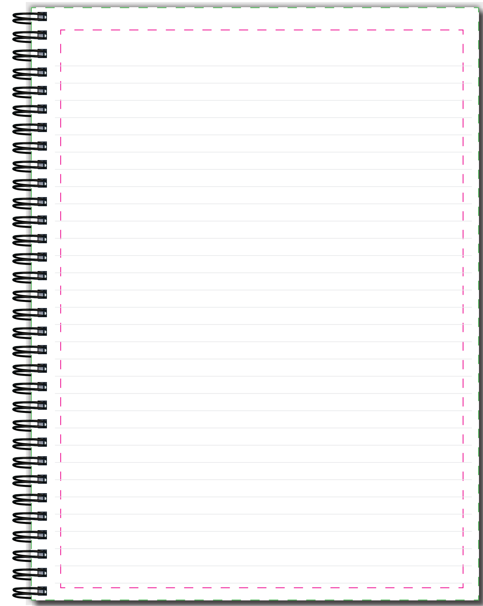
BJ2S - Sheets Size: 8.125 X 10.75 Imprint Area: 7.3125 X 10.125

Magenta - Imprint area Cyan - Imprint area with bleed (if available) Green - Finished size of item