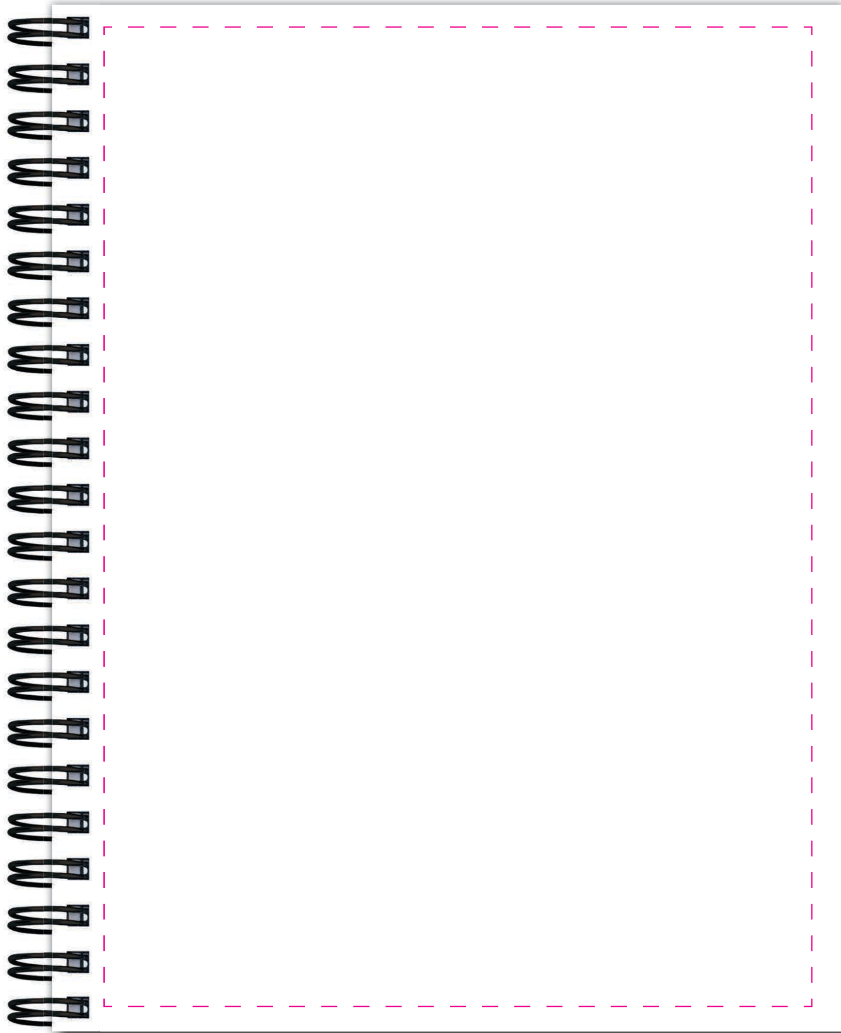
BJ2E - Cover Size: 8.375 X 10.875 Imprint Area: 18 square inches anywhere within the imprint area