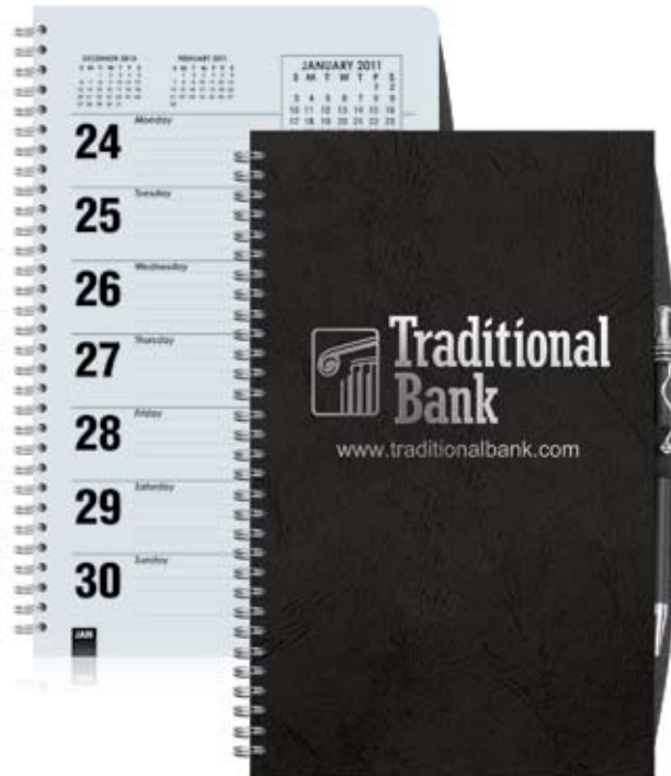
DC1F-PS - 5 1/4 x 8 1/8 Flex Weekly Planner