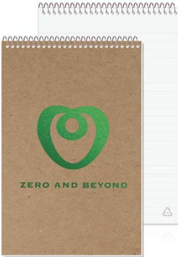
RSN1 - 5 3/8 x 8 1/4