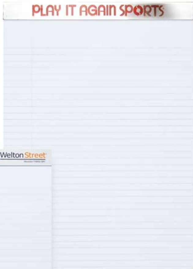
LP2 - 8 1/2 x 11 3/4