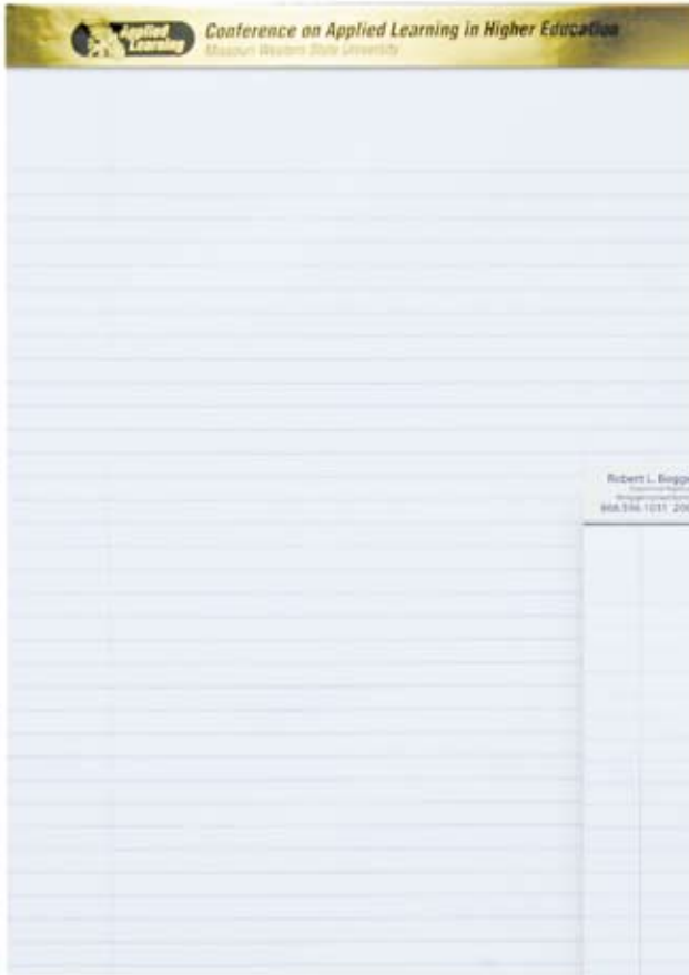
LP2 - 8 1/2 x 11 3/4