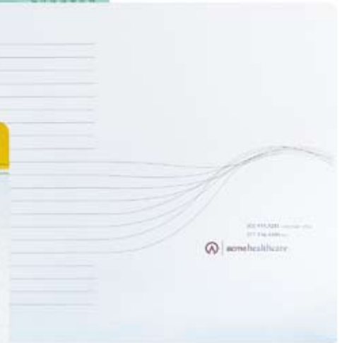
MP1 - 8 3/8 x 6 3/4 with bleed

MP1/MP2 Size: 8 3/8 x 6 3/4 Imprint Area: 8 1/8 x 6 1/4 MP14 Size: 8 1/8 x 6 3/8