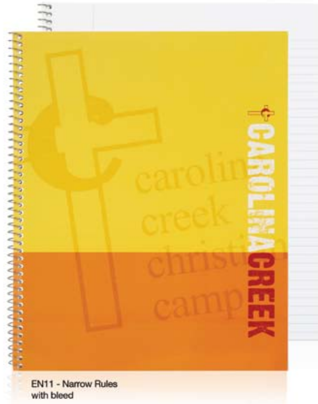
EN11 - Narrow Rules with bleed