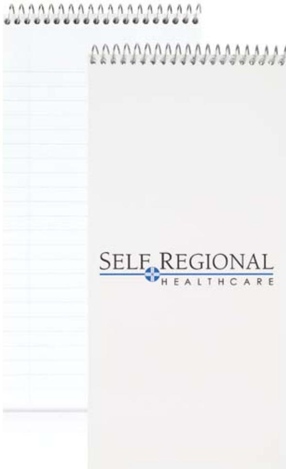
ERN1 - 4 x 8 1/4