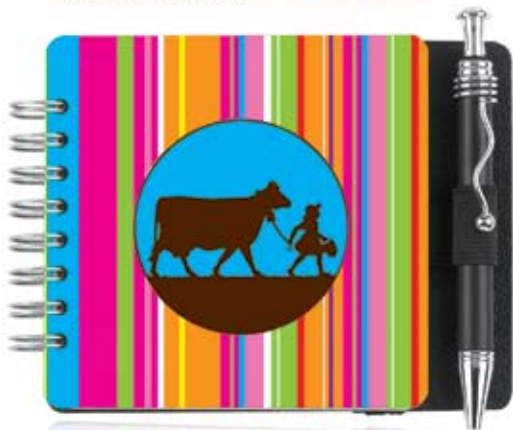
S1R4-PS - 3 11/16 x 3 11/16