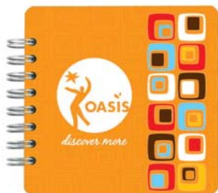
S1R4 - 3 11/16 x 3 11/16