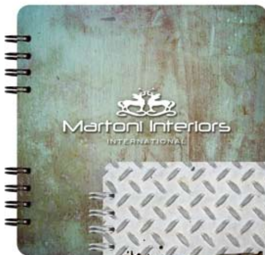
S2R4 - 5 x 5