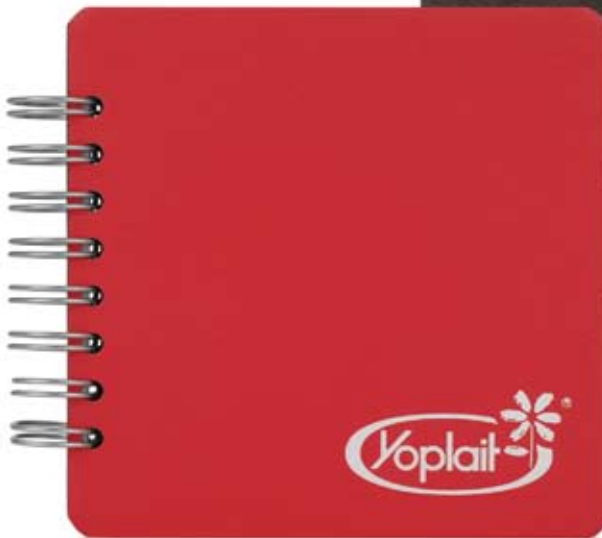
S1T - 3 13/16 x 3 11/16